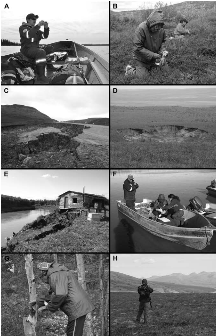
Figure 2. Photographs taken during participatory multimedia mapping of environmental conditions in the lower Peel River watershed, Northwest Territories: (A) Herbie Snowshoe using video to document ice conditions on the Peel River (May 2012); (B) Wanda Pascal and Emma Kay observing and collecting Labrador tea near the Yukon-Northwest Territories border (September 2012); (C) erosion of the Dempster Highway associated with